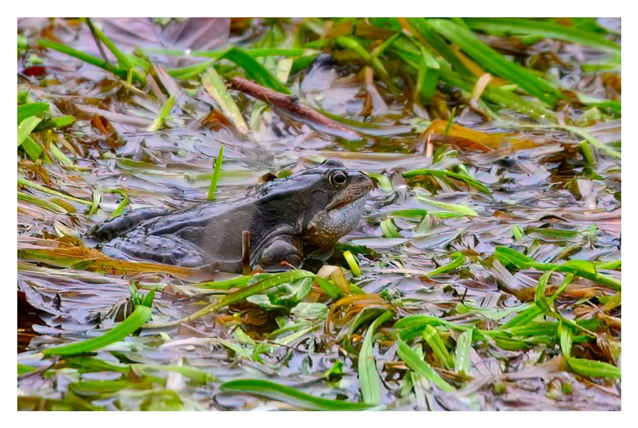
Common frog – Rana temporaria