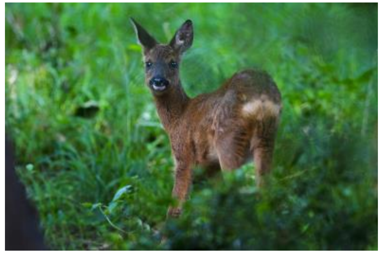
Roe deer - Capreolus capreolus