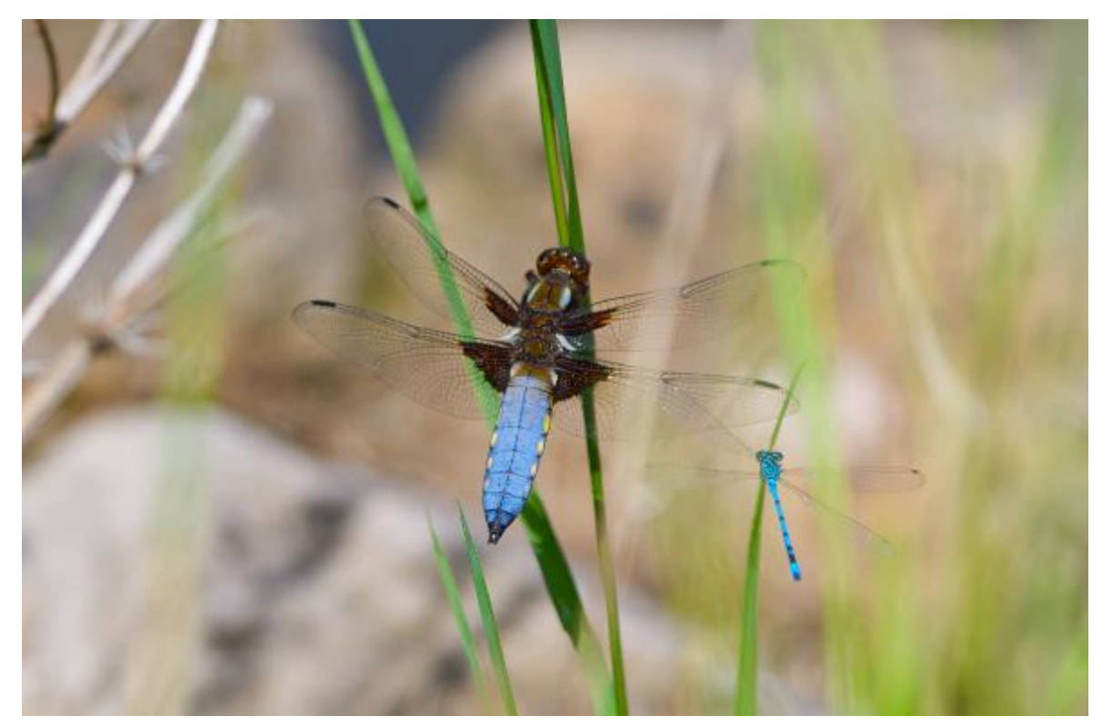
Male Broad bodied chaser - Libellula depressa (left) / Azure Damselfly - Coenagrion puella (right)